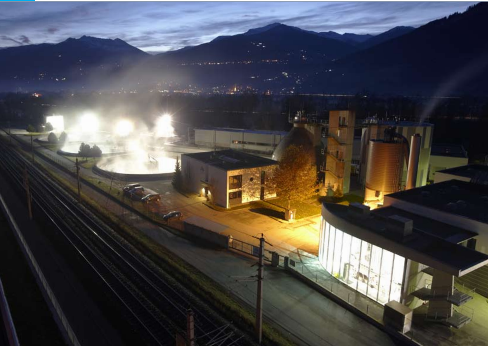
Fritzens, Austria, 6L 21/31