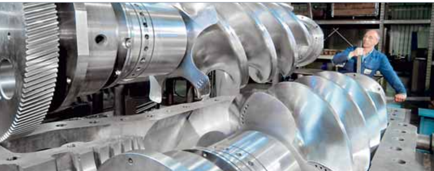
1 Large-scale rotors of SKUEL type screw compressor

Designed for suction flows up to 100,000 m 3 /h and discharge pressures reaching 50 bar, the robust process-gas screw compressor model series from MAN Diesel & Turbo is designed to handle highly contaminated gases and other gas mixtures under heavy-duty conditions that would curtail the availability and life expectancy of other compressor types.