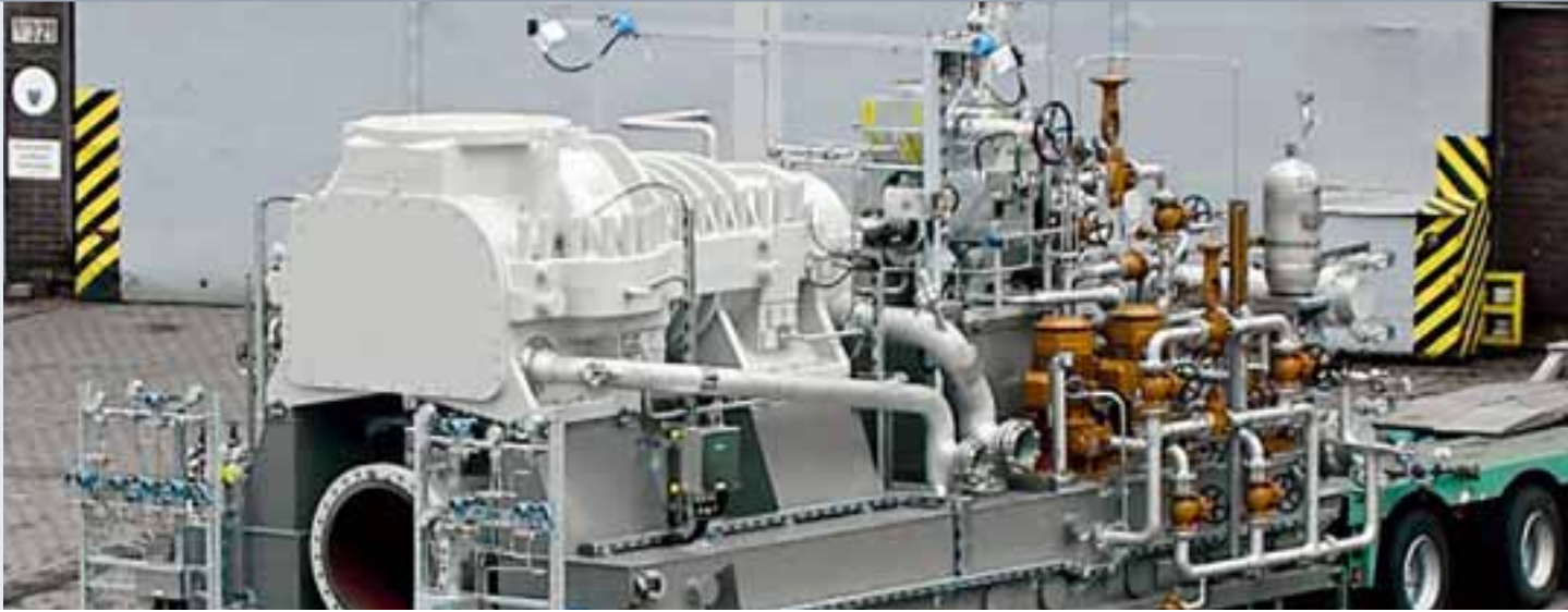
3 Steam-turbine-driven SKUEL type process-gas screw compressor packages for a styrene monomer process