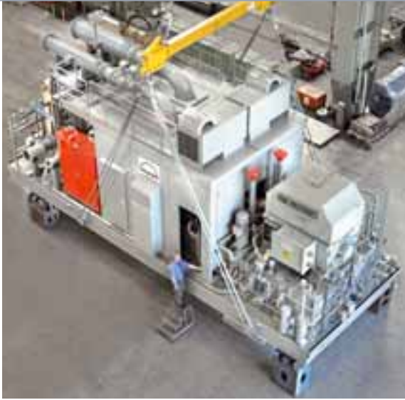
4 Electric-motor-driven 2-stage process-gas screw compressor package for an offshore application