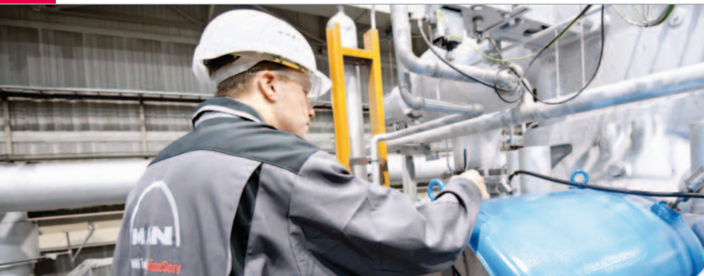
Condition evaluation – measurement of casing vibration

If there is a change in the vibration behaviour of machines and units, our experts from the Machinery & Systems Diagnostic team of MAN PrimeServ are able to assist in the diagnosis and cause analysis. Thanks to the OEM background of our staff, we can pinpoint vibration problems exactly, therefore, enabling you to increase the availability of the unit. To this end, we place all our knowledge and experience at your disposal and provide our services with maximum flexibility and reliability.