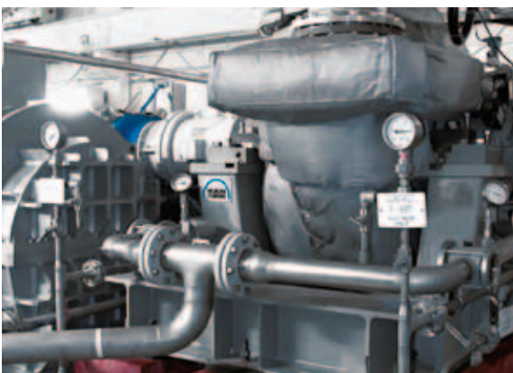
New expander in operation