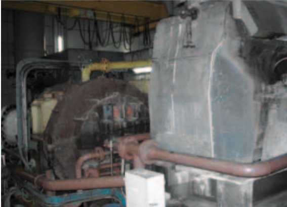
Original expander prior to the rebuild