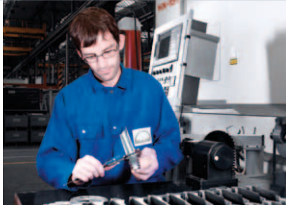
State-of-the-art production of expander blades