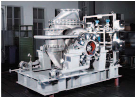
Fully assembled new expander package with instrument rack, ready for dispatch