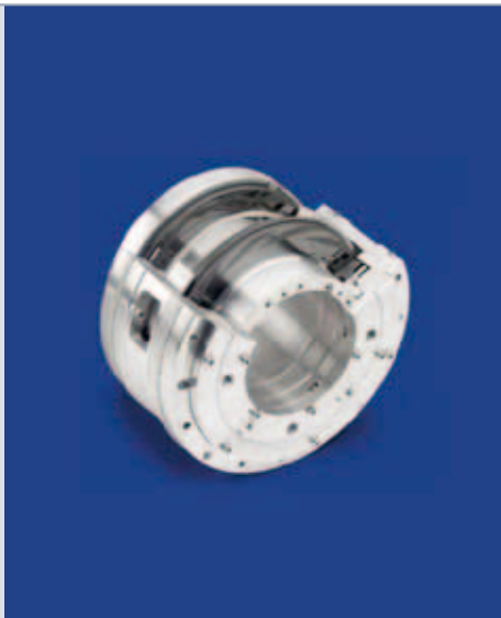
Typical dry gas seal cartridge