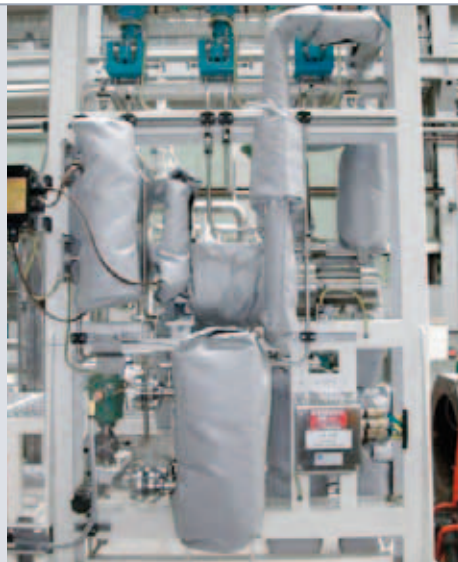
Booster rack with trace heating and insulation