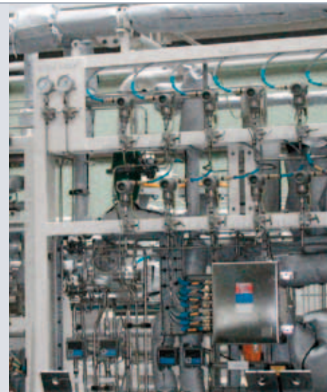
Dry Gas Seal monitoring rack

and operators policies call for a reduction of process gas releases to flare or environment.