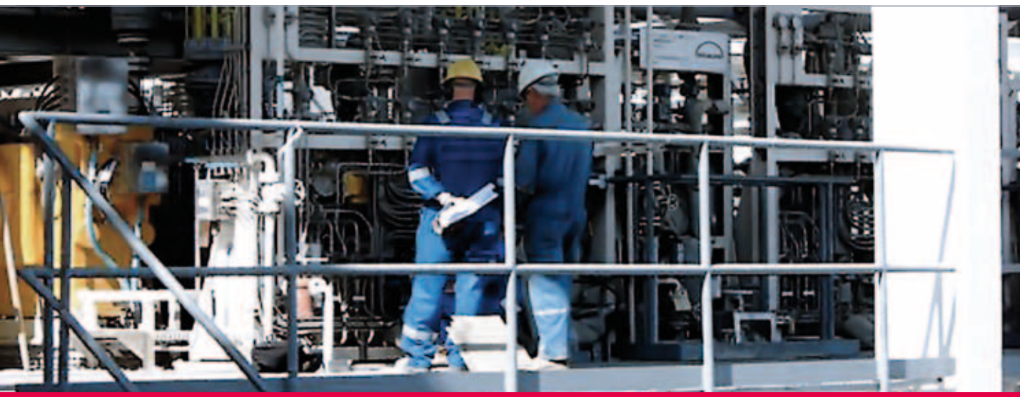
Dry gas shaft sealing system installation

The appearance of liquids or even hydrates in the Dry Gas Seals (DGS) may badly affect their trouble-free operation. If the sealing faces of the DGS are contaminated during pressurized standstill conditions they potentially suffer damage during compressor start-up. The booster rack provides clean, superheated seal gas to the DGS and hence prevents the formation of liquids and hydrates during times of pressurized standstill of the machine train.